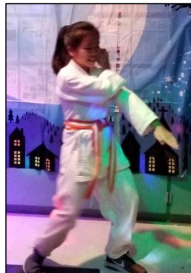
These and more Talent Show pictures are posted on our website: www.ourclass.us