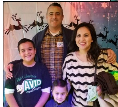
These and more Carnival pictures are posted on our website: www.ourclass.us